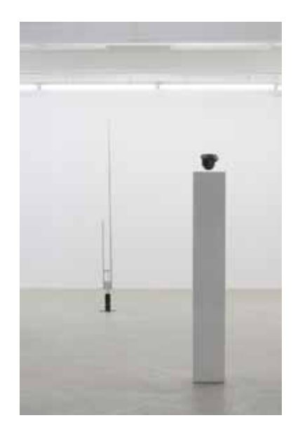
Endless Second and 88,7 (title variable)

In 88.2 MHz - the title changes in accordance to the radio frequency used in a given museum to broadcast the piece - a tape player linked to a radio transmitter and antenna emits the accumulation of silent pauses excerpted from radio broadcasts of different political, intellectual and economic speeches. The tape with the compilation of silences is an actual realisation of the fictitious work described in the short story by Heinrich Böll, Murke's Collected Silences (1955).